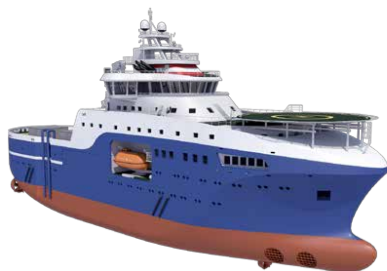
SERVICE OPERATION VESSEL

Motion compensated gangway designed for operation with 2.5 m Hs waves.