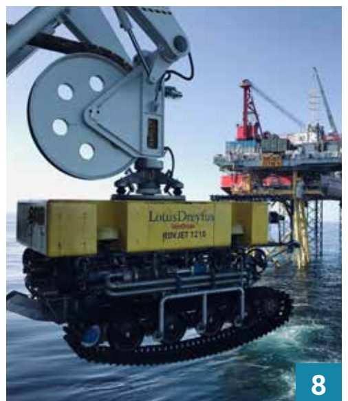
1 - Shipmanagement of the TAAF R/V MARION DUFRESNE. 2 - Dry bulk transportation. B-Delta37 Handysize bulkcarrier LA SOLOGNAIS. 3 - Cable laying and maintenance. New ASN cable ship ILE D'OUESANT. 4 - Dry Bulk transshipment. AL MARIA 1, Full Azimuthal Electrical (FAZEL) unit. 5 - Maintenance of onshore wind turbines by OPENR technicians. 6 - Transhipment in shallow waters. Deck Cargo Ship (DCS). 7 - Maintenance of offshore wind farms. Service Operation Vessel (SOV) WIND OF CHANGE. 8 - Submarine operations by Louis Dreyfus TravOcean ROV 1210.